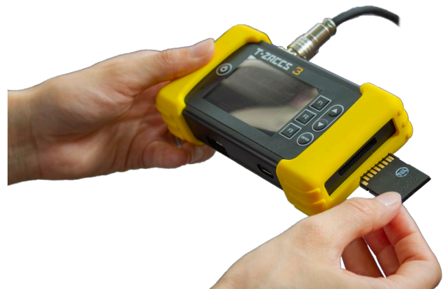
Easy operation and small size held in both hands